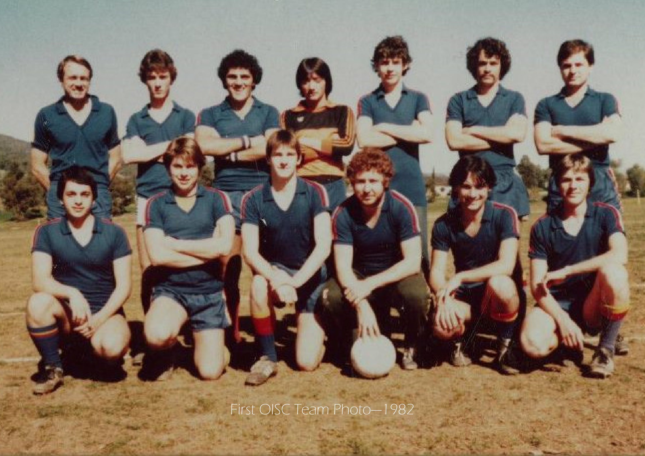
First OISC Team Photo—1982